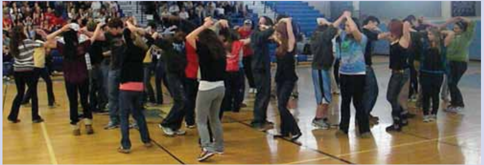
Sophomore Students during the Annual Golden Shoes Ballroom Dance Competition.