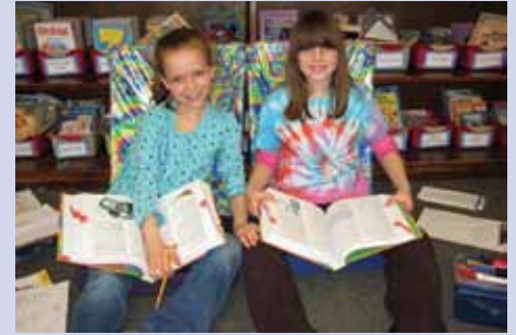
Students enjoy partner reading in the new Back Jack Chairs!

Thanks to the addition of the chairs, not only will the children continue to build their reading skills, but they are discovering that reading is an enjoyable way to relax and spend quiet time.