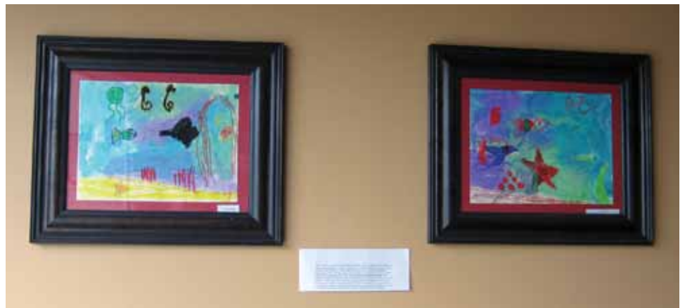
Beautiful artwork compliments of Medfield's kindergarten children, on display at Honey's.